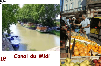
Canal du Midi