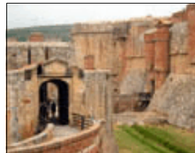
Chateau de Salses